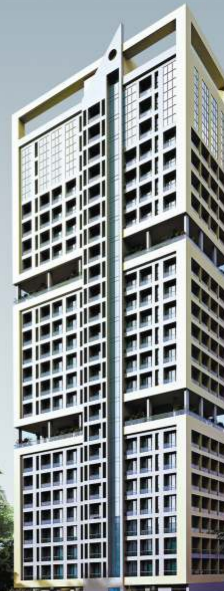
Dhana-Shree Solitaire Vikhroli