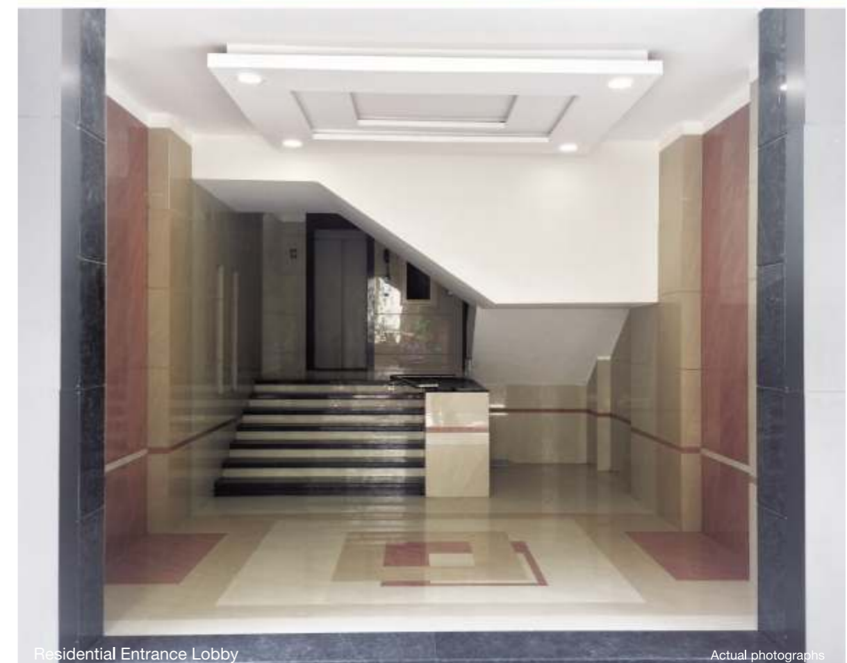
Residential Entrance Lobby