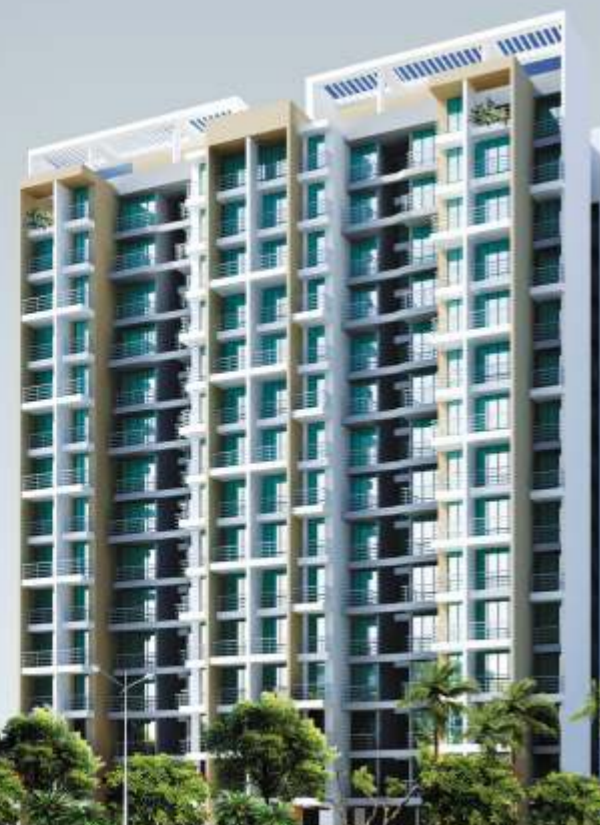
Dhana-Shree Pearl Taloja

creations in Mumbai, they have now set their sights on Navi Mumbai. Taking their first steps in Navi Mumbai, they recently launched few projects. Prominently among them is the Dhana-Shree Pearl at Taloja, with expansive spaces and high-end structural designs, the entire architecture been built in a way that showcases elegance in all forms. Also, Emerald with one of their ambitious verticals - M2 Developers is an iconic project in Ulwe. It is excellent in design and magnificent in scale; a project that has at its disposal, every possible facet of a great lifestyle. Slowly, but steadily, the Group has expanded its horizons, only raring to go beyond excellence.