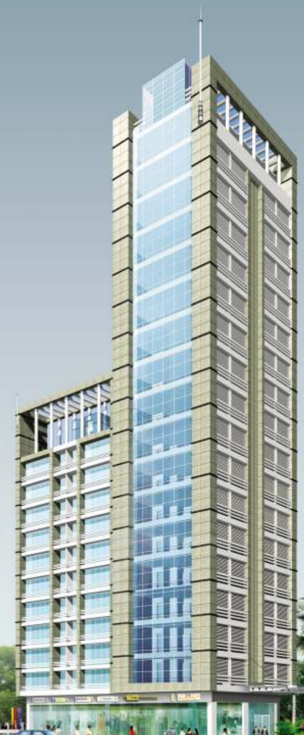
Dhana-Shree Heights Andheri