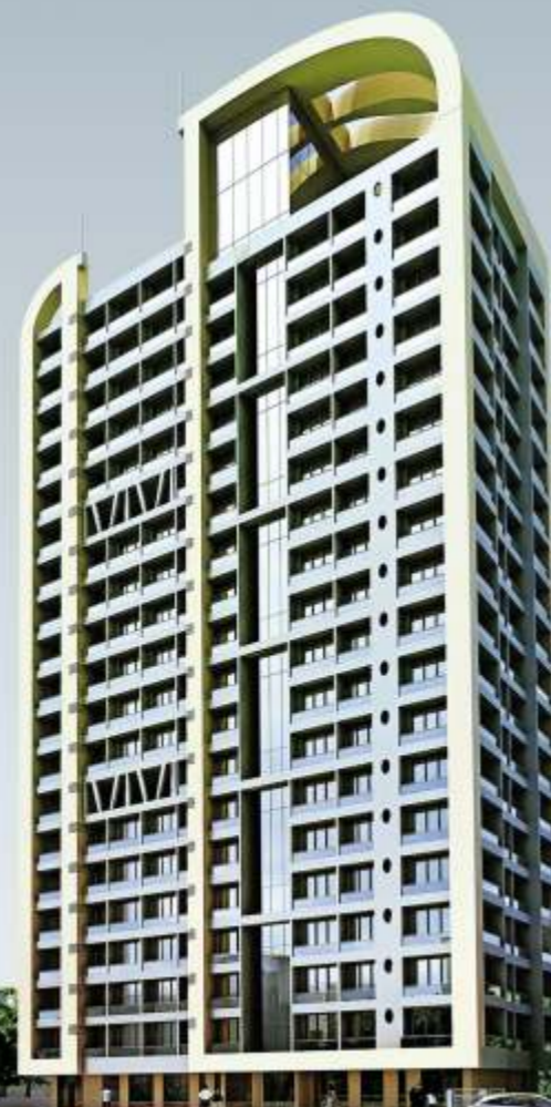
Dhana-Shree Sapphire Vikhroli